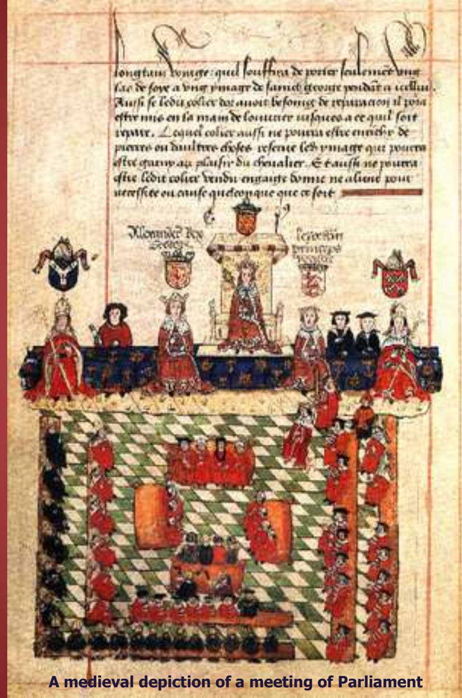
A medieval depiction of a meeting of Parliament