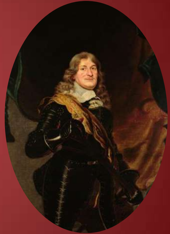
The Fredericks of Prussia