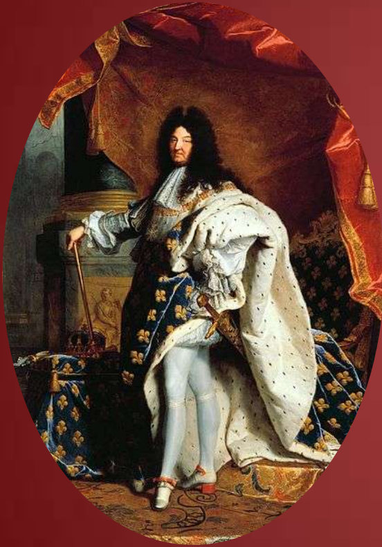
Louis XIV of France