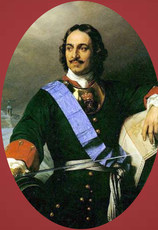
Peter the Great of Russia